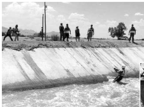
▶ During a practice drill, a lifeline helps a "victim" escape the surging waters of the Franklin Canal in El Paso.