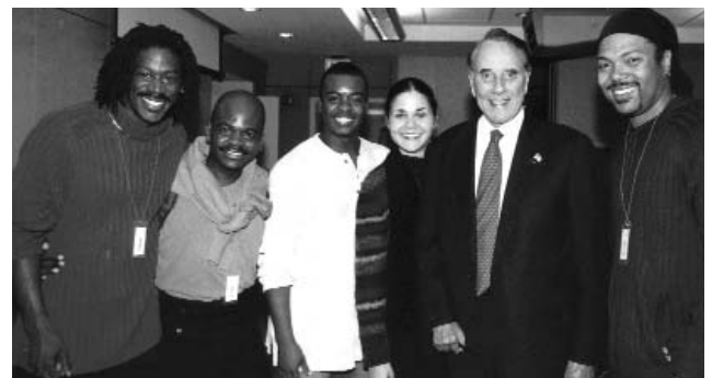
Bob Dole with "The Wild Zappers," a dance troupe comprised of persons who are hearing impaired. The group performed during the program.