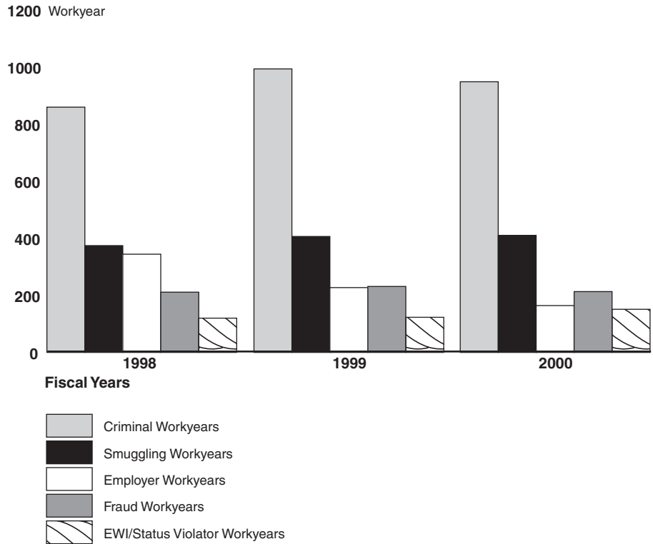
Figure 1: INS District Office Investigations Workyears

Notes: Workyears are total hours divided by 2,080 (assumes a 40-hour week times 52 weeks). Service Centers do not maintain these data. EWI means entered (the United States) without inspection (by INS).