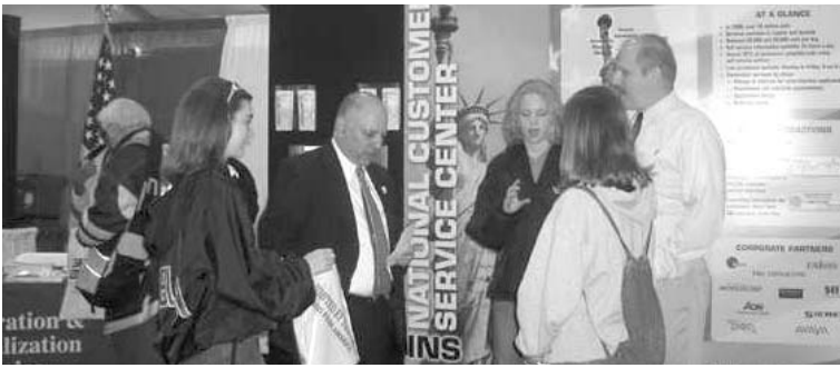
Students interested in careers with the INS discuss possibilities with National Customer Service Center representatives.