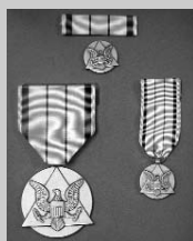
Commander's Award for Public Service medals.