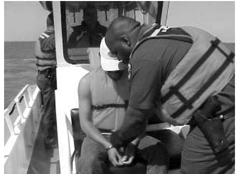
Coastal patrol checkpoints resulted in 14 aliens being taken into custody as part of Operation Argus.

Under Operation Argus, coastal patrol checkpoints were conducted at Baratavia Pass near Grand Isle, La., and Belle Pass near Port Fourchon,