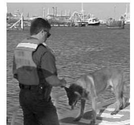
A Border Patrol canine sniffing during alien-smuggling operations.

"The Coast Guard and Customs Service, Marine Enforcement Branch, were a great help," he said. "Without their assistance, we would not have been as successful as we were."