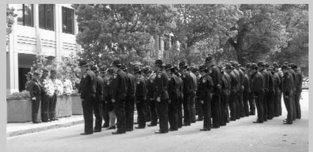
Uniformed officers bow their heads in a moment of silence honoring the agency's fallen officers at a ceremony in front of Headquarters.