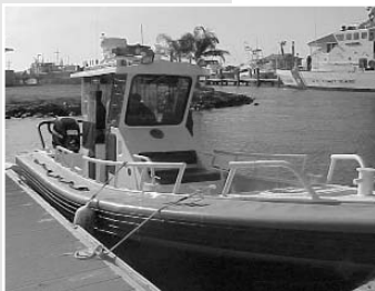
Coast Guard and Border Patrol fleets working together under Operation Argus.