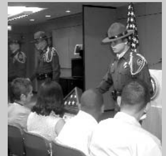
Members of the Border Patrol's Honor Guard present the American flag to the families of the fallen officers.