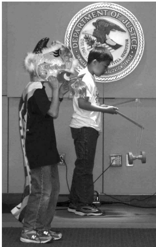
Students from Hunters Woods Elementary School perform a traditional Asian dance as part of the Asian Pacific American Heritage month celebration at Headquarters.