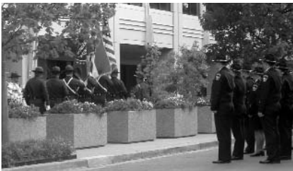
The Border Patrol Honor Guard marches past the wreaths honoring the fallen officers.