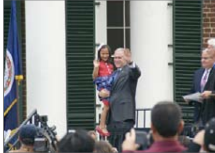
President Bush attends Monticello Naturalization

The 46th annual Monticello Independence Day Celebration and Naturalization Ceremony was held at the home of President Thomas Jefferson in Charlottesville, VA on July 4, 2008 with special guest and keynote speaker President George W. Bush.