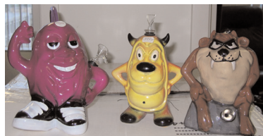
Drug paraphernalia in the image of cartoon characters were among some 8,000 items seized by ICE agents in Jacksonville, Fla.

No arrests were made in conjunction with the seizures. However, the ICE investigation into the case continues. ■