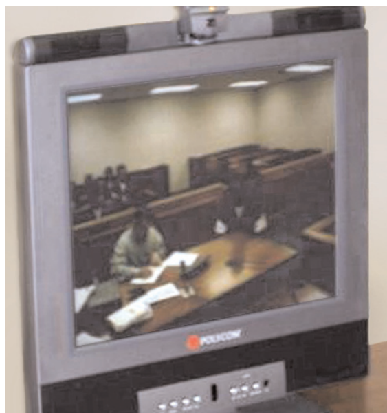
An alien in ICE custody appears before an immigration judge during a teleconference hearing. ICE and the Honduran government have agreed to a pilot which will use this technology to allow Honduran officials to conduct counselor interviews with Hondurans in ICE custody.