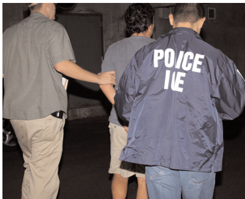
ICE officers escort one of 99 fugitive aliens arrested in a statewide operation in Florida targeting aliens who had failed to surrender to ICE after receiving final orders of deportation.