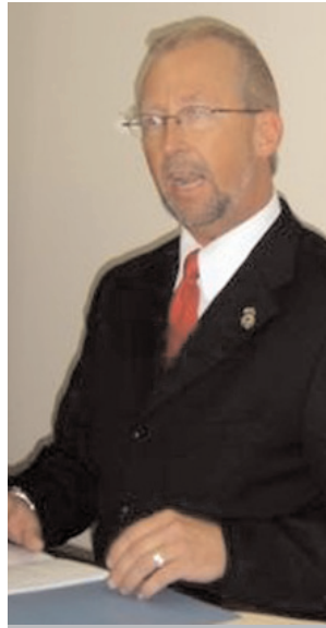
Marc Moore, field office director of the ICE San Antonio Office of Detention and Removal Operations, speaks during a news conference announcing an agreement between ICE and the Honduran government to begin a pilot program designed to speed the removal of Hondurans.

ER is an administrative process aimed at reducing the number of “Other than Mexicans” (OTMs) who have spent less than 14 days in the United States and who are apprehended within 100 miles of the border. OTMs apprehended under ER are detained and quickly returned to their countries of origin after receiving their travel documents. They are not required to appear before a federal immigration judge. ■