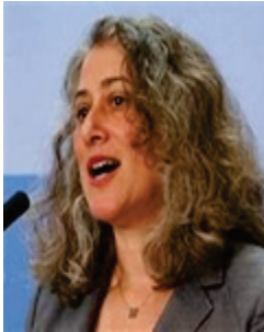
Audrey Singer Brookings Metropolitan